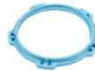
MATRIX FIX COLLAR TB-CR.