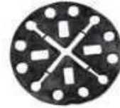
MATRIX DAMPER TB-A (40 Units Bags)