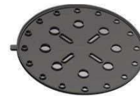
MATRIX Slope Correctors, sit under bottom pedestal, avoids all impacts from drain slopes.