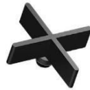
MATRIX Plus shape formed joint strips can be sit in the middle of pedestal and have 3mm thickness. Height 16mm.