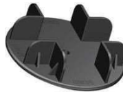
MATRIX X formed Carcass Assembly Equipment does sit on top and central of the pedestal.